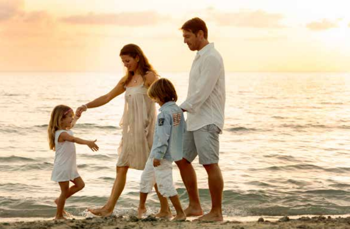
Hapimag Resort Paguera, Spain