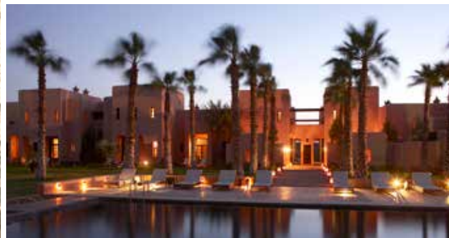
Hapimag Resort Marrakech, Maroc