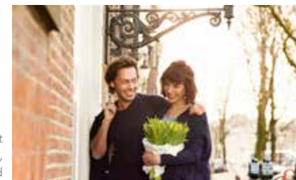
Hapimag Resort Amsterdam, Nederland