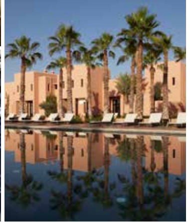
Hapimag Resort Marrakech, Maroc