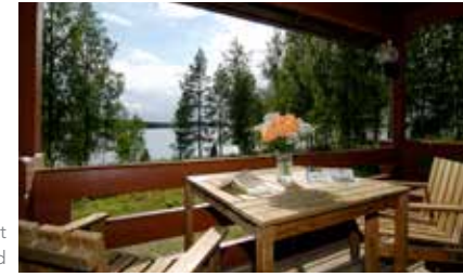
Hapimag Resort Punkaharju, Finland