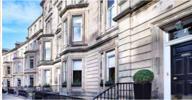
Hapimag Resort Edinburgh, Great Britain